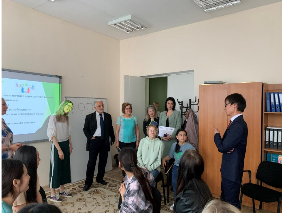
Training with the participation of students with disabilities: the monitoring team met with students with disabilities who were participating in a training program