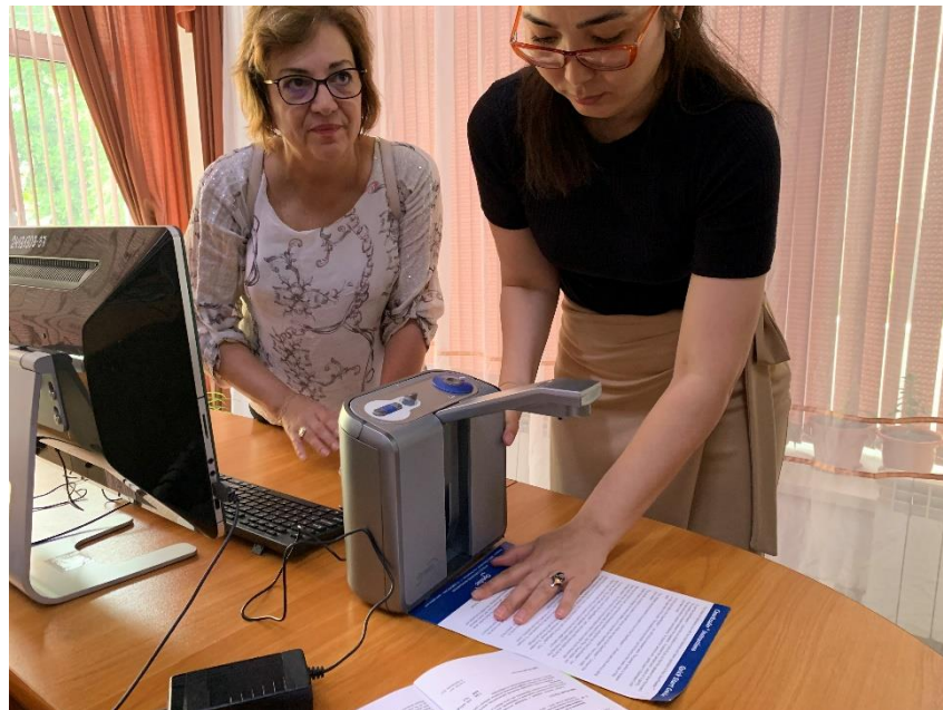
Meeting with the staff of the library of the KRU named after A.Baitursynova: the librarian shows to the monitoring team the devices used in order to facilitate education for students with blindness