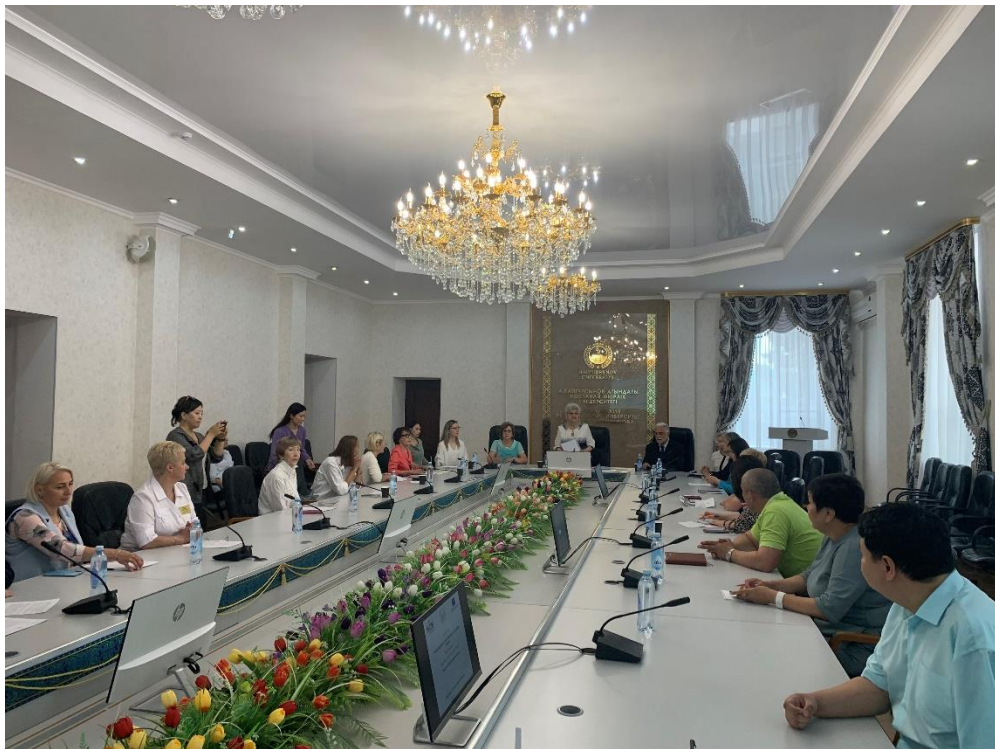
Opening of the Round table on the topic "Actual problems of formation of inclusive competence"