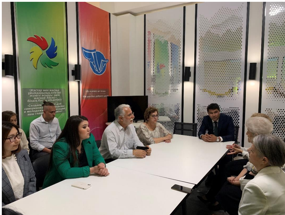
Round table discussion in the editorial office of the regional newspaper "Kostanay news " and "Kostanay Tany" on the topic "Higher education for persons with disabilities as a means of their integration into society".