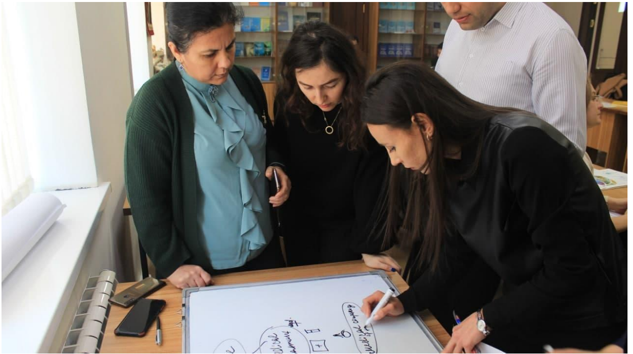
Interactive group activity during the Module 8