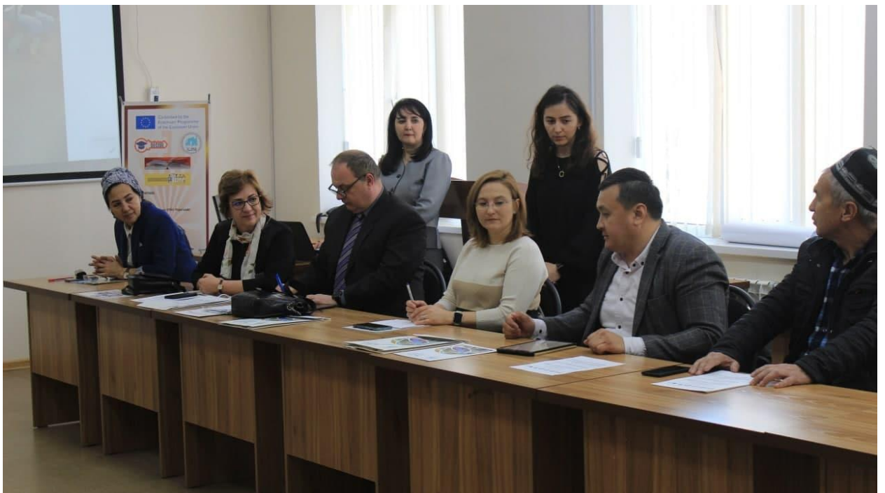
The NGO President of People with Motor Disabilities presents the main problems they are facing.