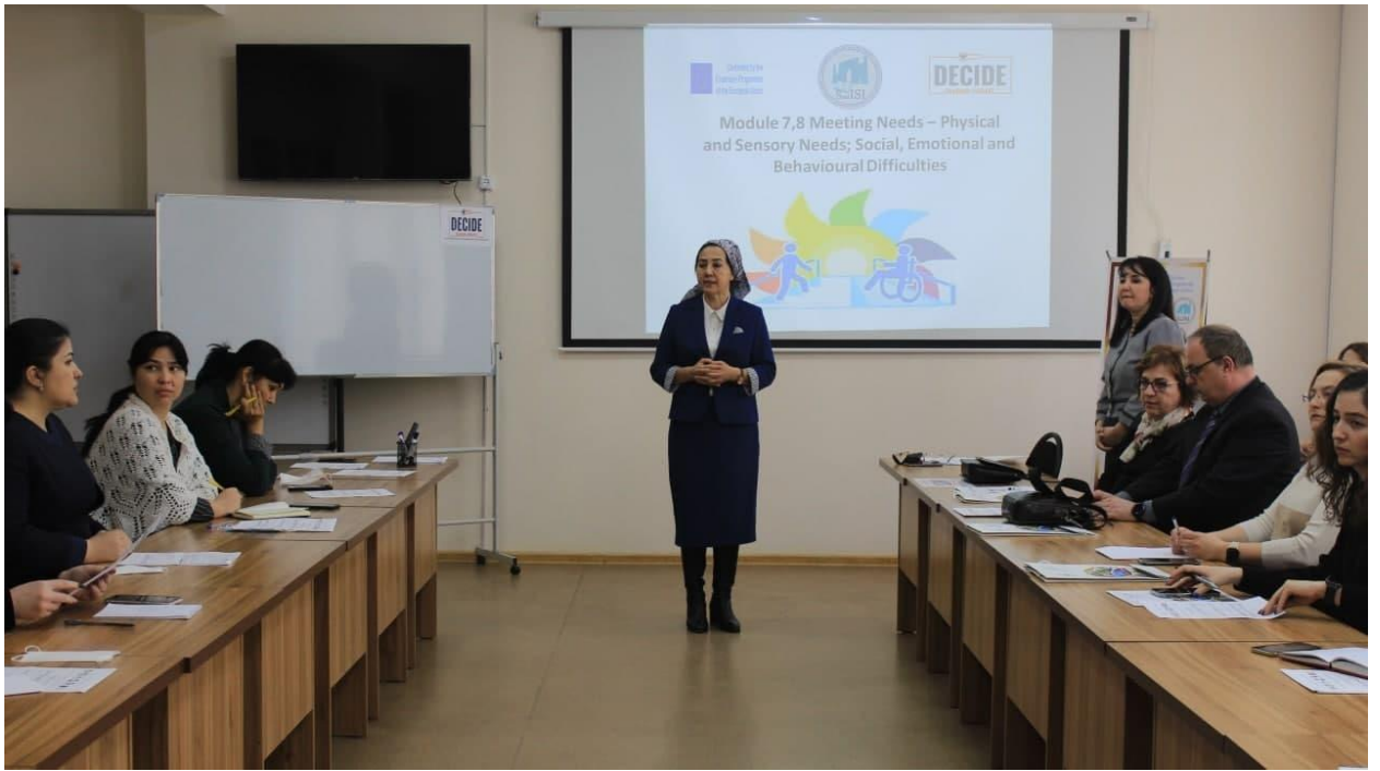
The Vice-Chancellor opens the event