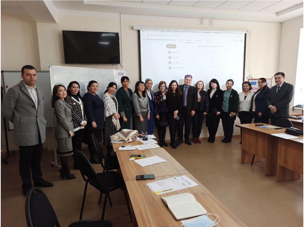
Group photo with participants in Piloting of Module 8