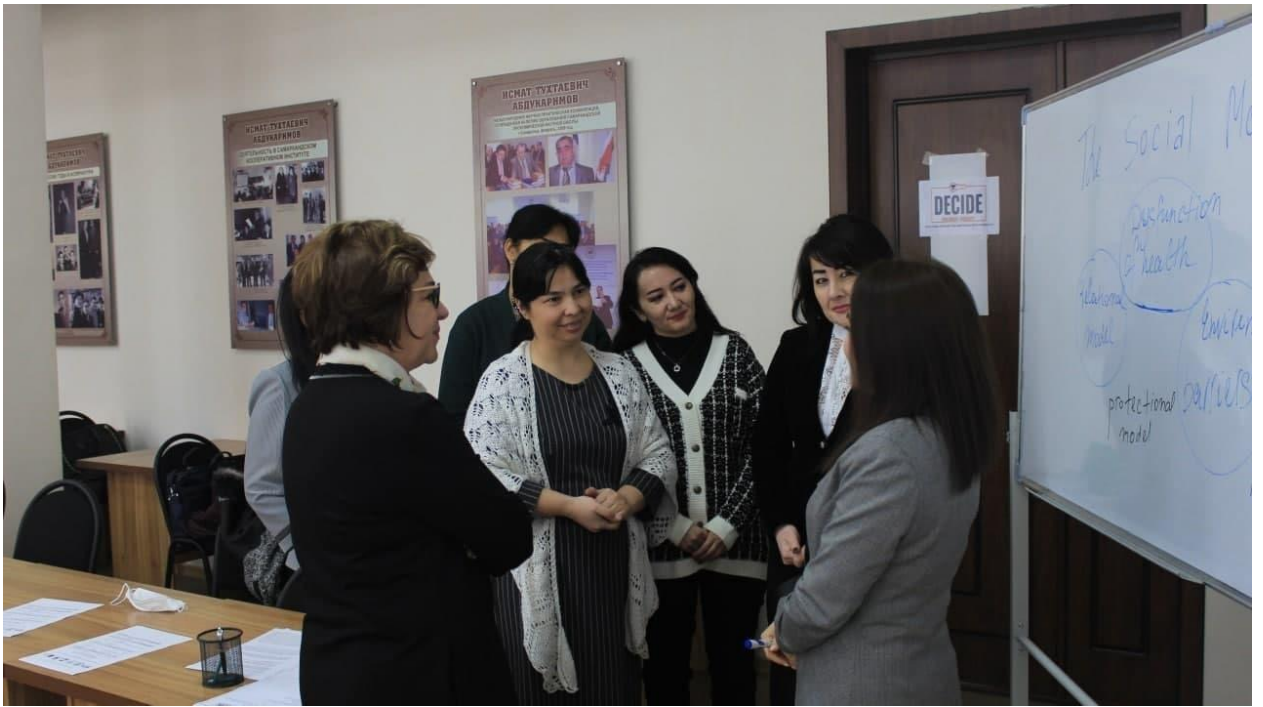
Interactive group activity during the Piloting of Module 7