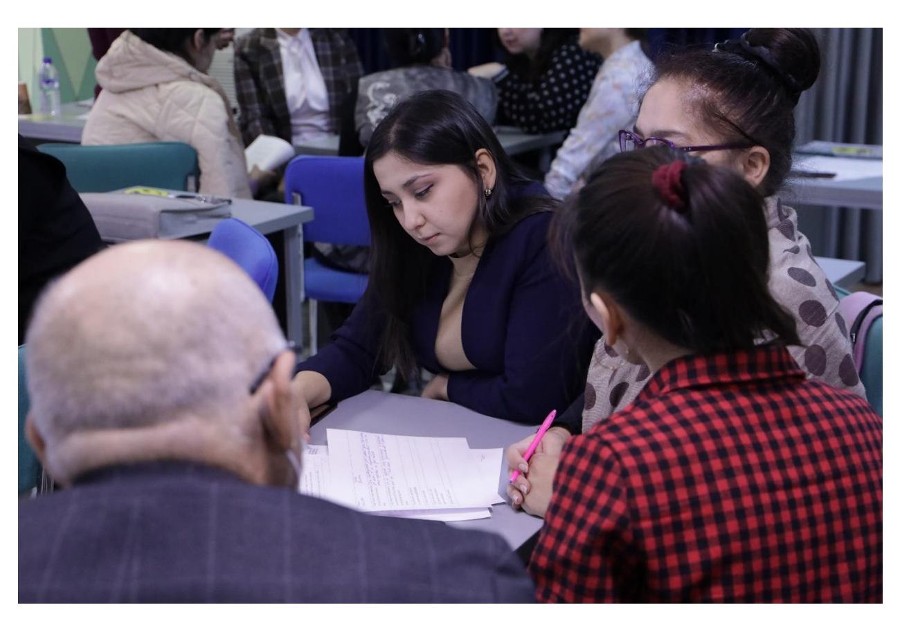
Group activity during module 5 at Pilot 1 of the DECIDE Curriculum held at "MUSHTOQ KO'ZLAR" Society of social mutual aid of disabled children Tashkent.