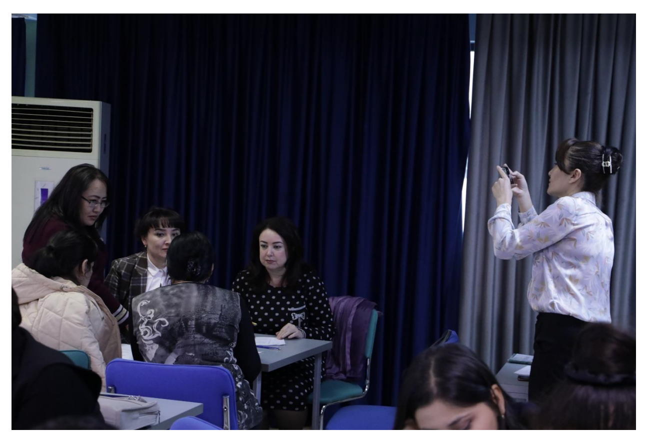
Working groups preparing presentations at Pilot 1 of the DECIDE Curriculum held at "MUSHTOQ KO'ZLAR" Society of social mutual aid of disabled children Tashkent.