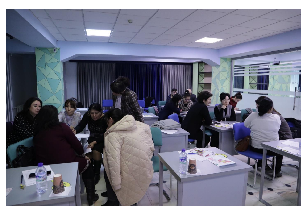
Group activity during the Piloting of Module 1 at Pilot 1 of the DECIDE Curriculum held at "MUSHTOQ KO'ZLAR" Society of social mutual aid of disabled children Tashkent.