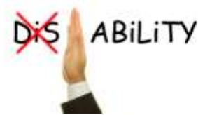
People with disabilities

Now, in developing counties 90% of children with disabilities do not attend schools due to learning difficulties , AI technology can create such tools with the help of AI workflow system which can build a deep connection between people with disabilities and let them help with marginalization, example, an artificial AI technology hand can learn human natural hand's movements and reactions while storing information in data memory system; hence, altricial technology hand would know when it needs to use those moments to use for future events automatically and collaborate with natural hand to perform the task. Such tools can make life easier for people with disabilities and a pivotal moment to help to make technology better.